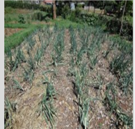
Plot of onions farmed "God's Way." On the right is the conventional approach. In a country struggling for adequate food and water supplies, the way seems clear.

While we mourn the loss of Wangari Maathai in Kenya, we are hopeful that her legacy will live on in these children.