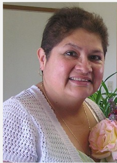
Snake River Housing Director

I have worked from the age of 7 years old - working in the field until I got married in 1979. My husband and I have 3 biological children and raising