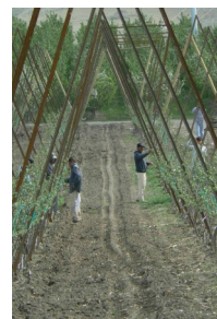
Doing the last touches to the V-Style trellising

and excellent work. He also added that crews were excited about the new V-Style trellising planting system in Wallula.